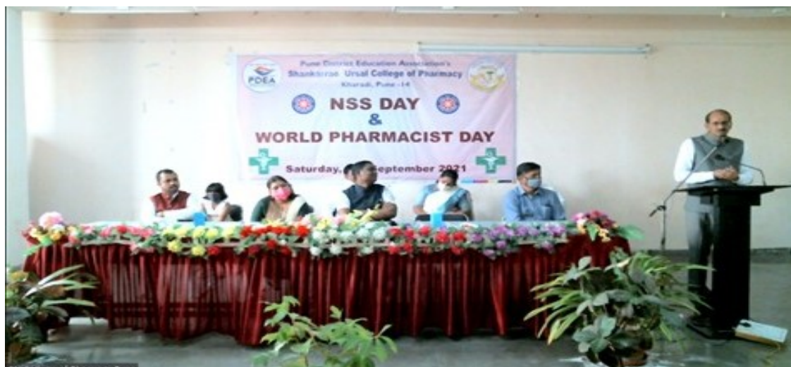
Celebration of NSS Foundation Day

NSS foundation day 24 th September was celebrated by the NSS students in the college. Students gathered in the college in the morning and decided to do the NSS activities very enthusiastically and with full of devotion on the memory of this day. They were given information about how the birth of NSS was there at national level. What activities are performed under this activity and what are the responsibilities of the students as NSS volunteer. How it is working at National level, State level, University level and College level.