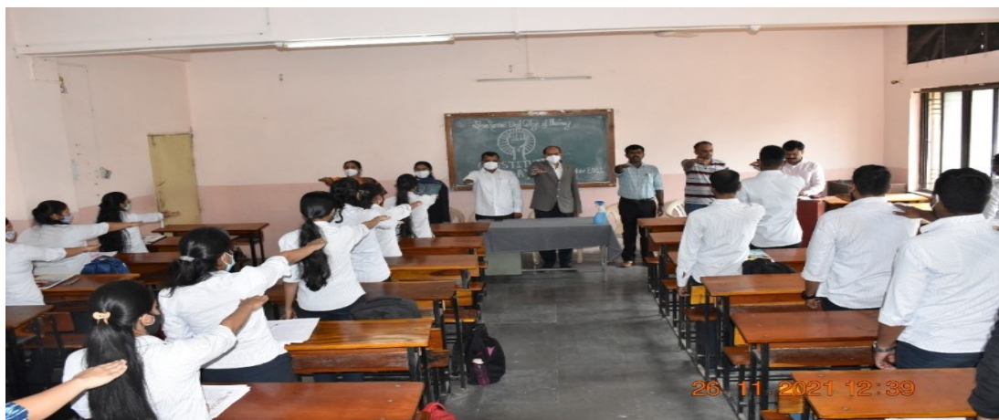
Principal, Faculty and Students taking pledge of 'Constitution Day'