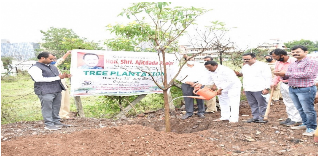
Tree Plantation on the occasion of 62 nd Birthday Celebration of Hon. Shri. Ajitdada Pawar (Dy. Chief Minister of Maharashtra and President- P.D.E.A, Pune)