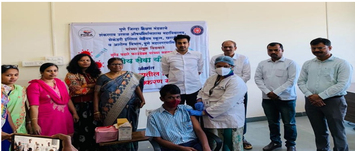
Student receiving COVID-19 vaccine during the free vaccination drive