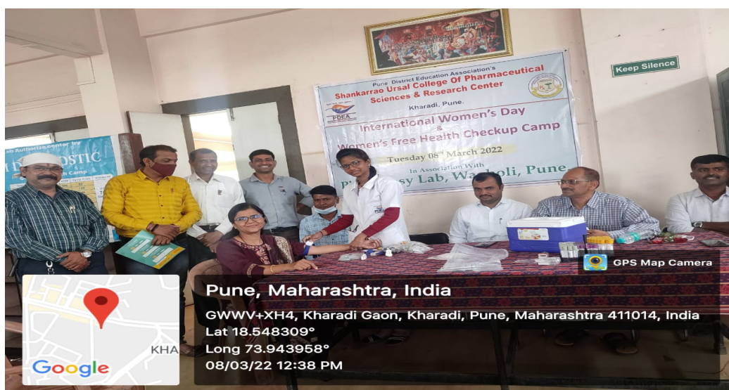
Free Health Check-Up Camp for women on the occasion of International Women's Day