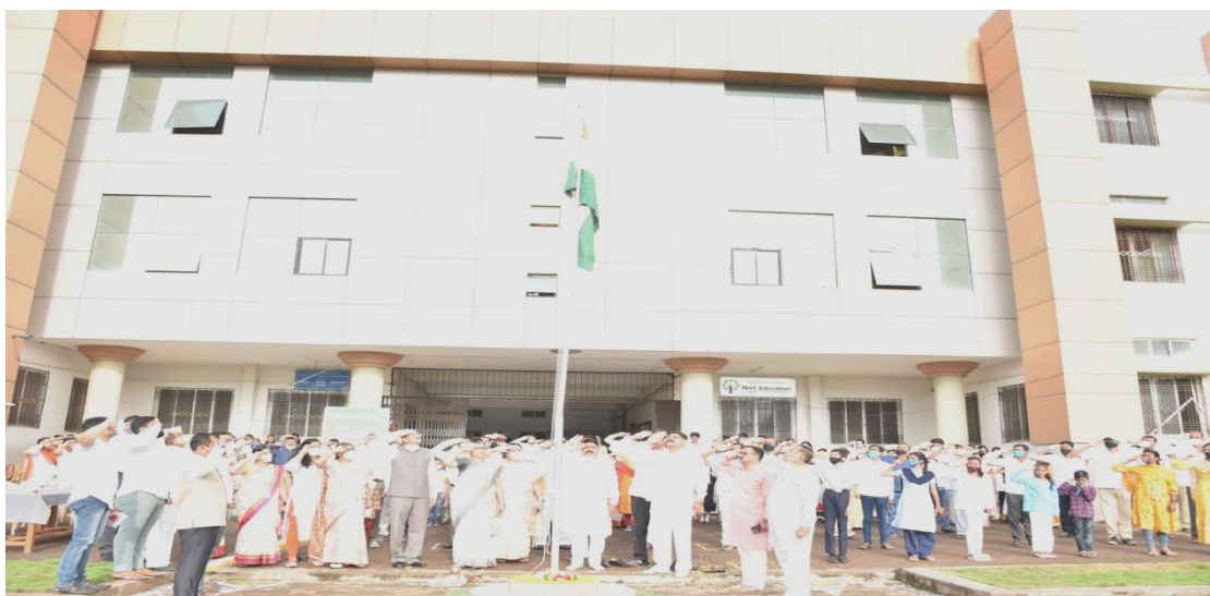
Celebration of Independence Day

Independence Day was celebrated at 15 th August 2021. The flag hoisting was done at 7.45 am by the auspicious hands of respected dignitaries. On this occasion Hon. Shri. Bapusaheb Pathare, Ex. MLA Wadgaon sheri constituency, addressed to the staff members. Our honorable principle also gave best wishes. After that the programme was finished and all were given a refreshment.