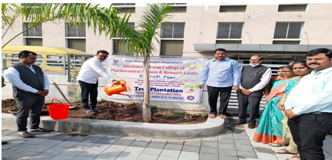
Tree Plantation on the occasion of celebration of 81 st Birthday of Hon. Shri Sharadchandraji Pawarsaheb