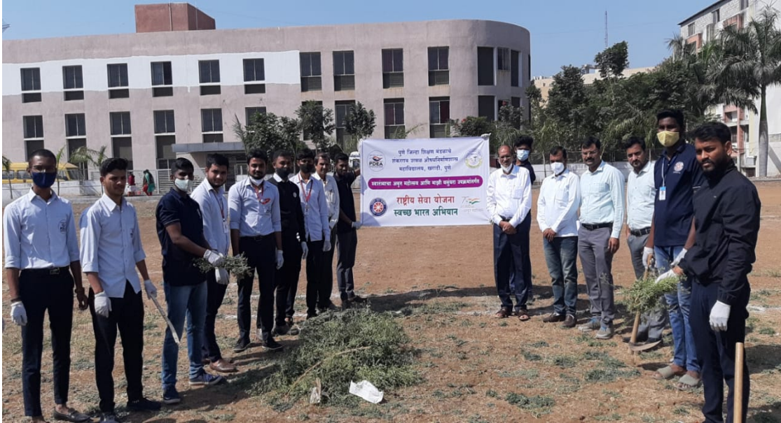
College campus cleaning activity under Swachh Bharat Abhiyan